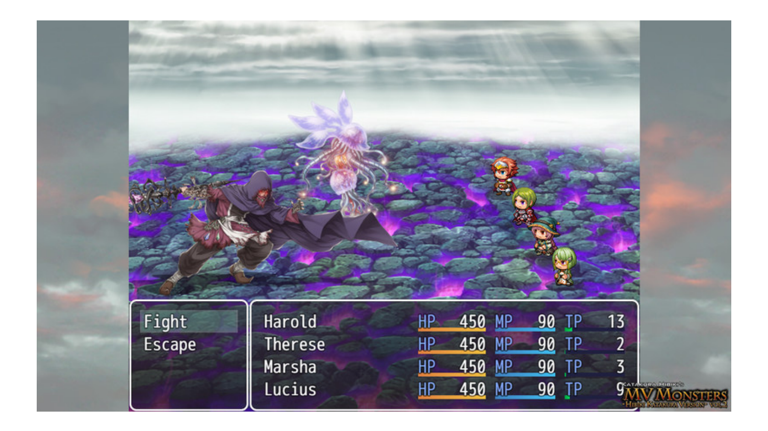
RPG Maker MV - MV Monsters HIBIKI KATAKURA Ver Vol.2 Download]

Download >>> <a href="http://bit.ly/2SKc9KE">http://bit.ly/2SKc9KE</a>